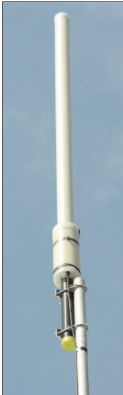
An alternative method of mounting the E-H antennas: directly on to a 1.5in dia pole.

Where I did have some difficulties was in experiencing some sort of flashover at higher power levels,